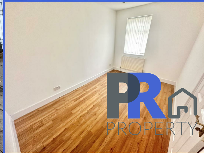
9a Guildford Street, Luton, LU1 2NQ £900 Per month